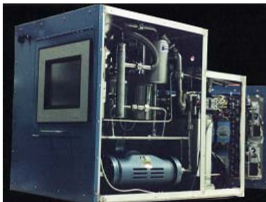
Under bench unit with pull up touch screen computer for easy operation

The beds are located in a circuit with by-pass lines around them and suitable valving to permit any bed to be included or excluded.